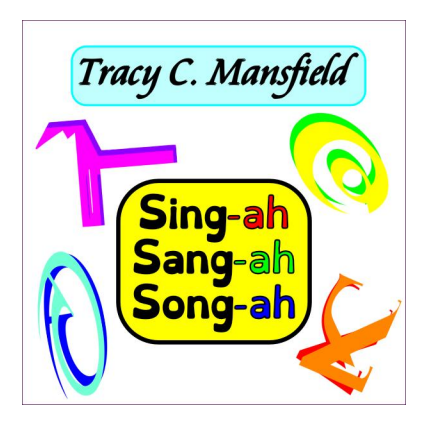
Sing-ah Sang-ah Song-ah