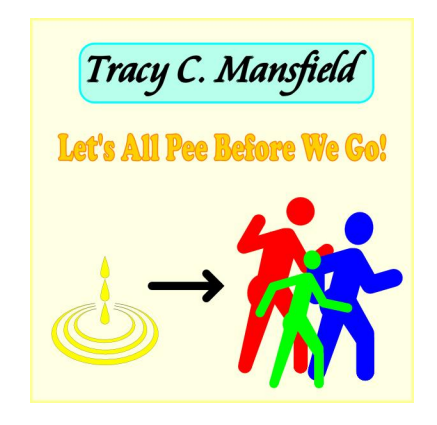
Let's All Pee Before We Go!

Some folks' zero is blue, but for some that hue is two. Black white brown pink jade teal gray, cyan purple copper... cool!