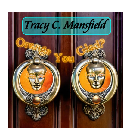
Orange You Glad?